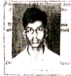
14. CANDIDATE'S SIGNATURE