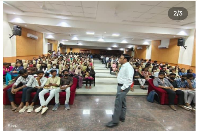
Students attending Seminar on Personality Development