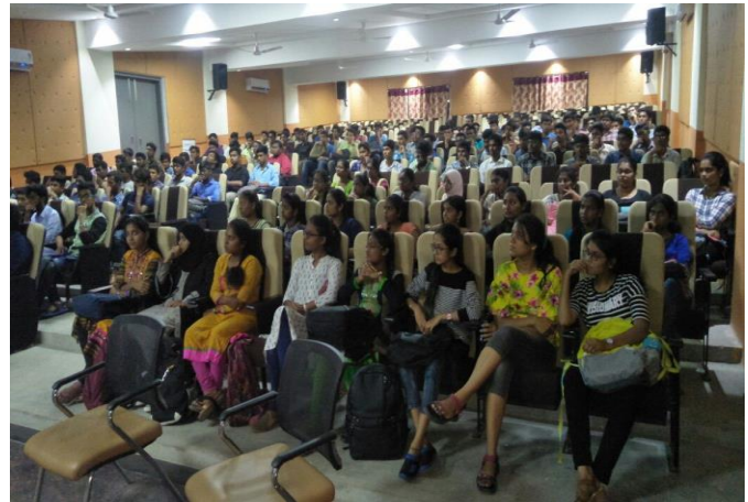
Students attending Seminar on Guidance for competitive examinations.