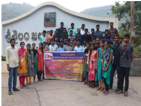
Srisaillam (Right) Power Plant Industrial Visit by Student of III-EEE-GNI

Local industrial visits are arranged for II and III Year students Outstation Industrial tours will be permitted for final years only during the semester break.