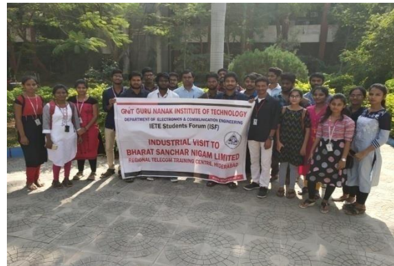
Visit To Bsnl, Regional Telecom Training Centre, Hyderabad