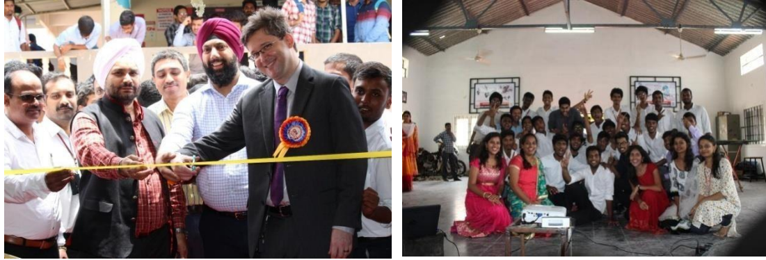
Team Super Ignite 5.0 Inaugurated A New Centre of Excellence Lab for Automobiles in August 2018