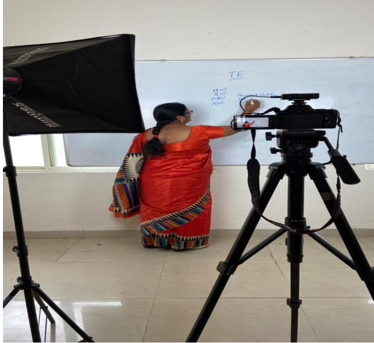
Class room equipped with LCD, computer & Internet connection